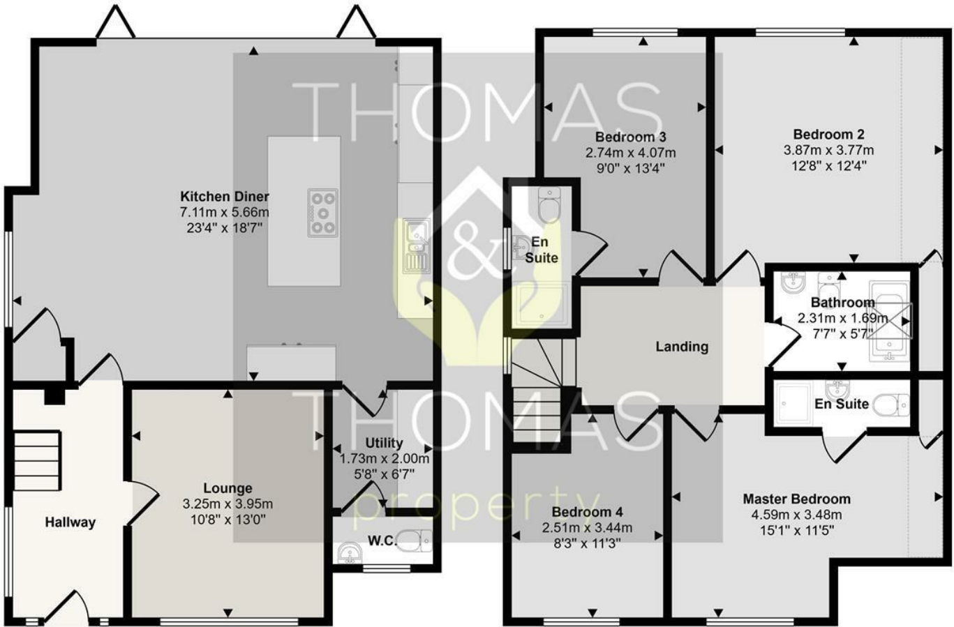
Ground Floor Approx 66 sq m / 713 sq ft

Approx Gross Internal Area 135 sq m / 1448 sq ft