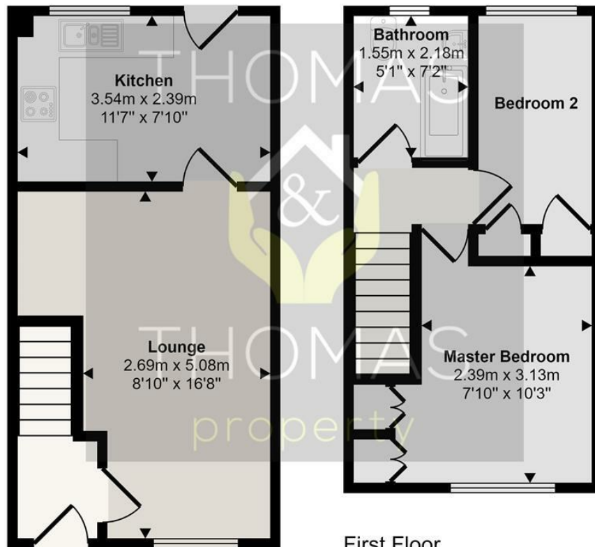
First Floor Approx 23 sq m / 246 sq ft

Approx Gross Internal Area 50 sq m / 540 sq ft