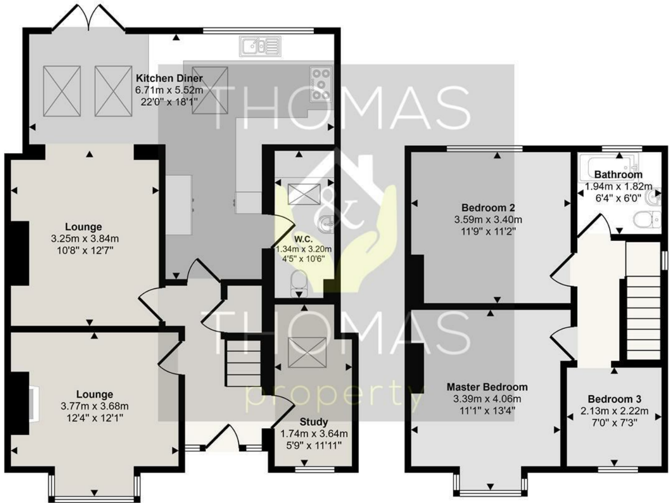
Ground Floor Approx 70 sq m / 752 sq ft

Approx Gross Internal Area 111 sq m / 1190 sq ft