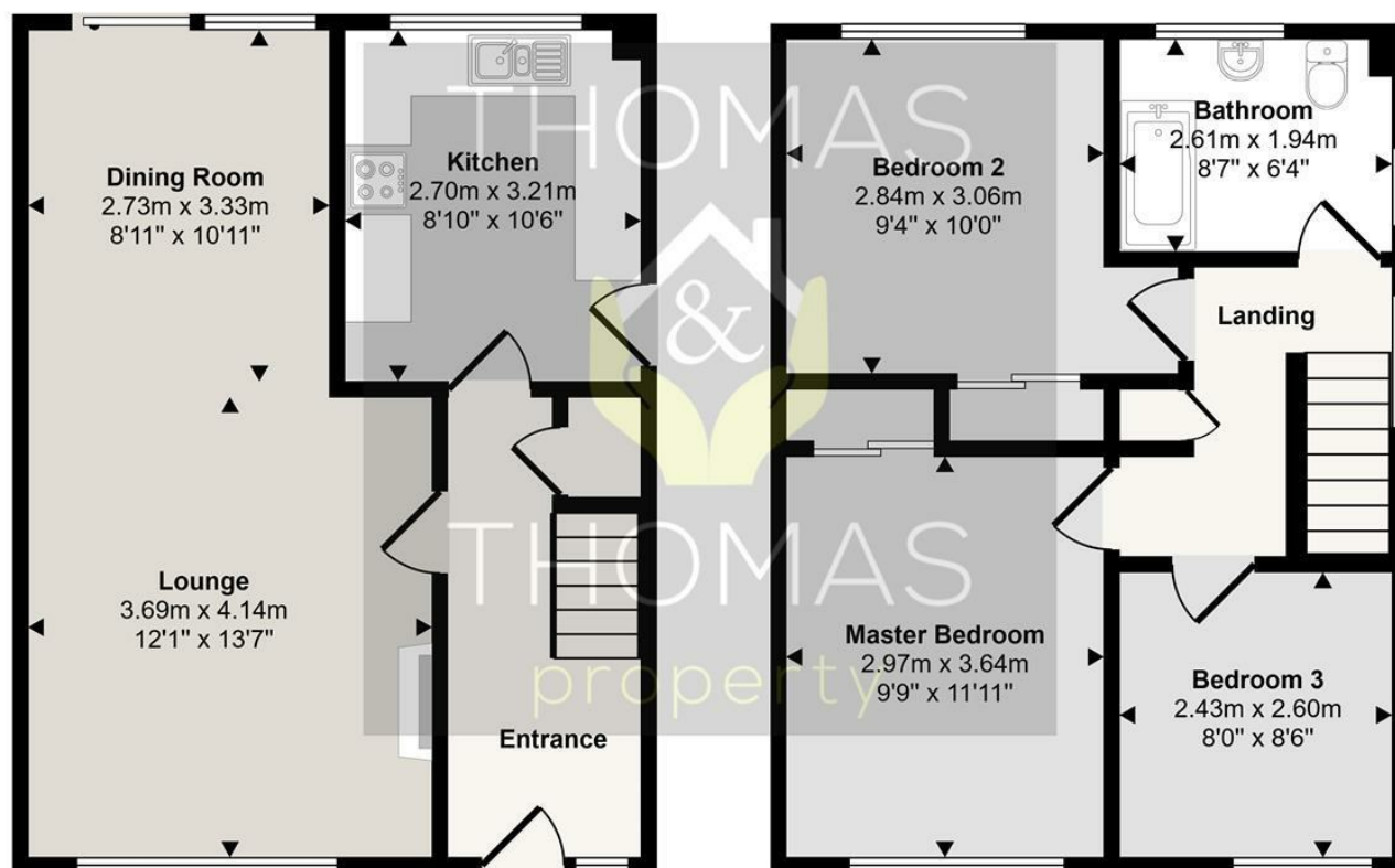
Ground Floor Approx 42 sq m / 457 sq ft

Approx Gross Internal Area 84 sq m / 905 sq ft