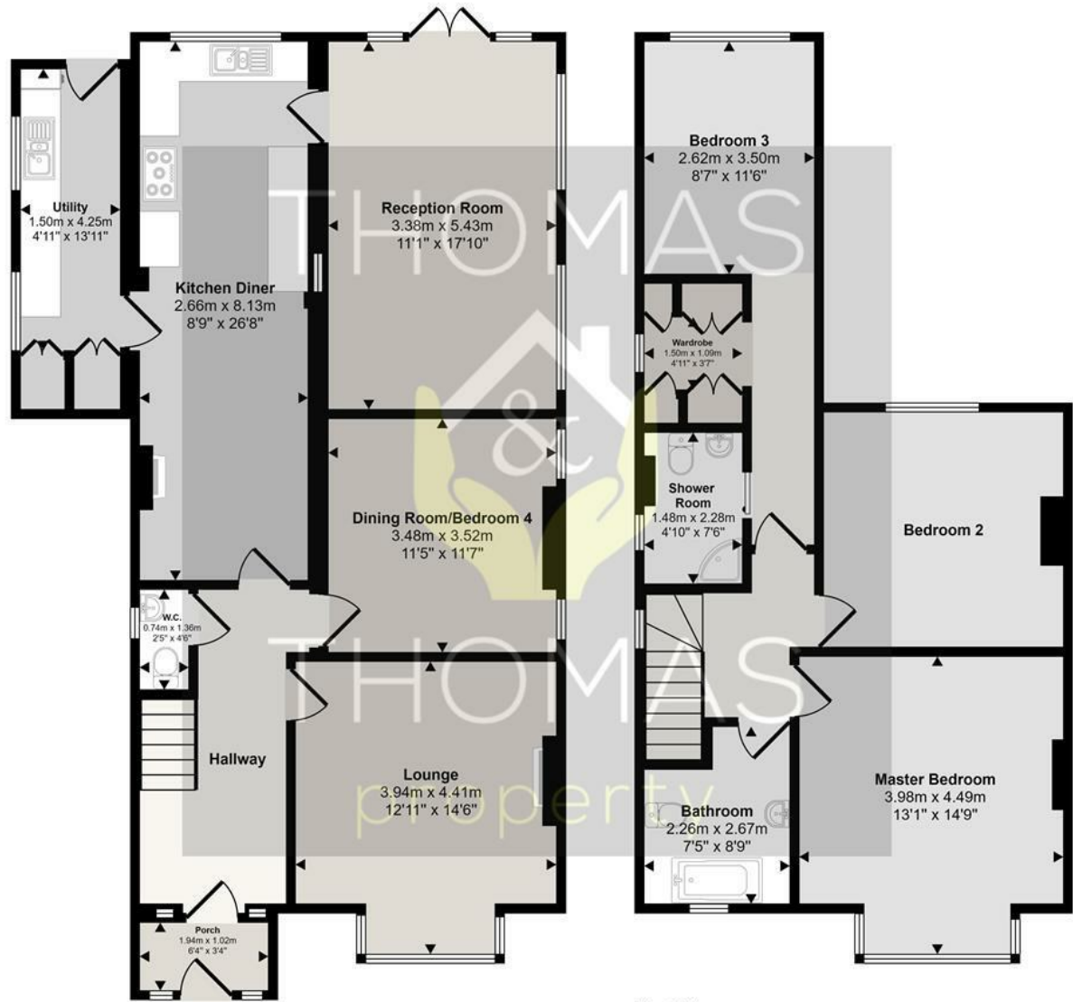
Ground Floor Approx 95 sq m / 1019 sq ft

Approx Gross Internal Area 158 sq m / 1705 sq ft