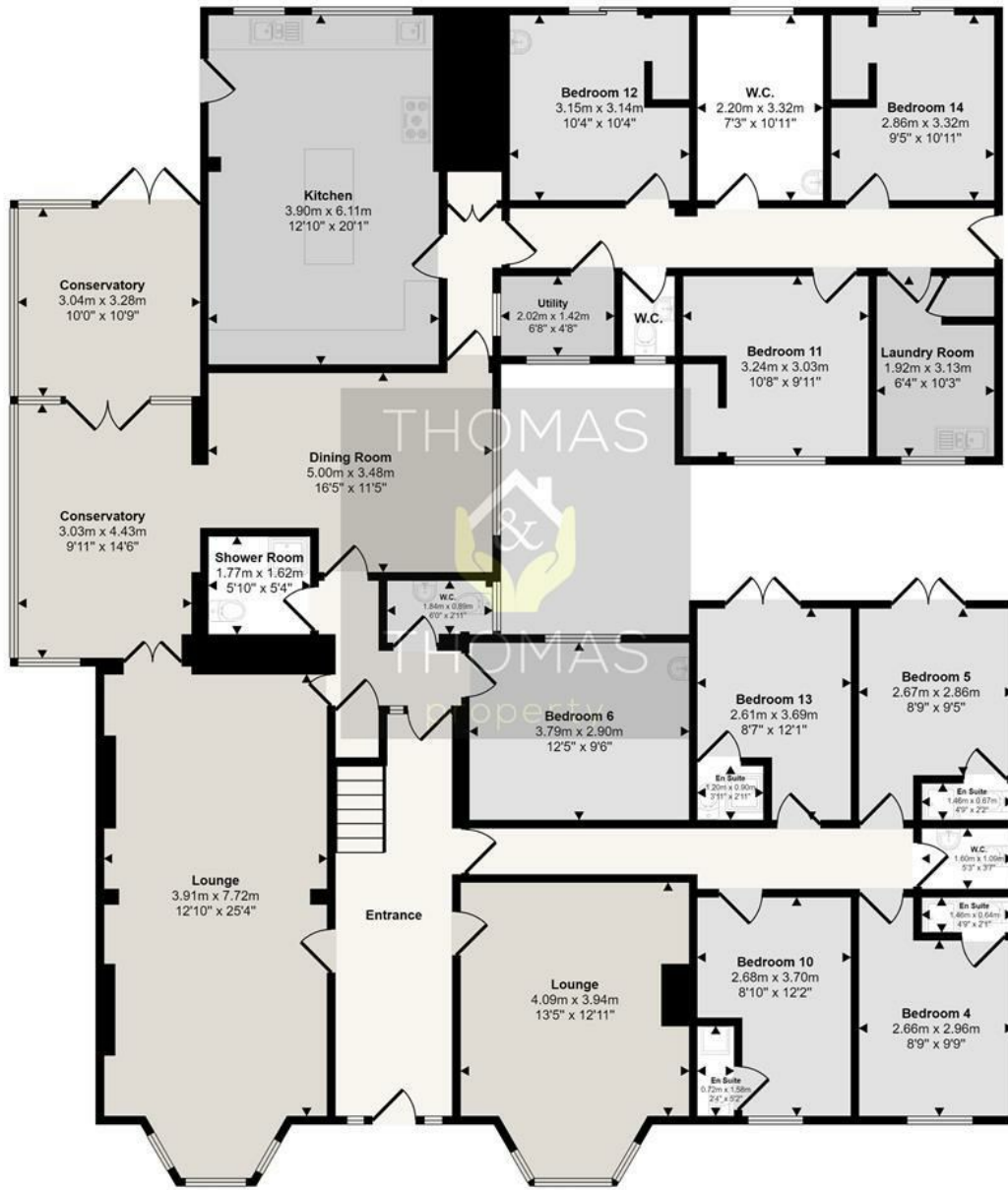
Ground Floor Approx 281 sq m / 3027 sq ft

This floorplan is only for illustrative purposes and is not to scale. Measurements of rooms, doors, windows, and any items are approximate and no responsibility is taken for any error, omission or mis-statement. Icons of items such as bathroom suites are representations only and may not look like the real items. Made with Made Snappy 360.